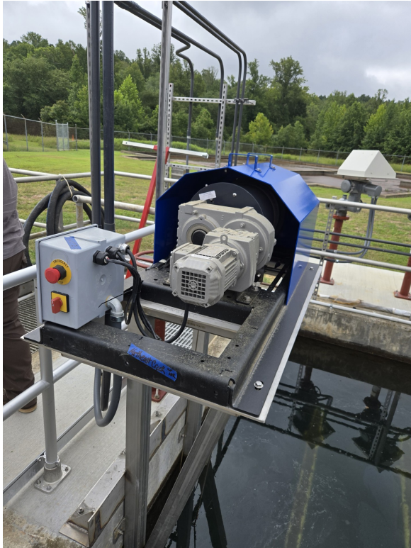
Sludge Collection Pulley Motor