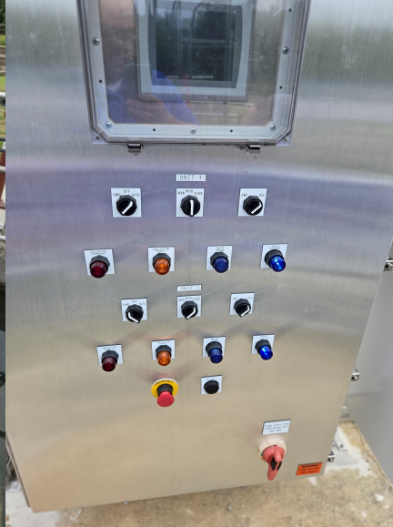
Sludge Collection Control Panel